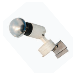
Lampa spot SS30 100W EUR 12.00 Cod 019.010.200.008