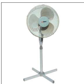
Ventilator cu picior EUR 7.00 Cod 025.010.500.020