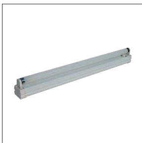
Corp fluorescent tip SS30 EUR 18.00 cu un tub D-170 - A Cod 019.010.190.001