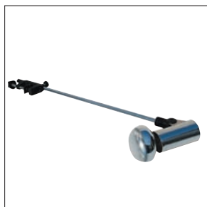
Lampa spot cu brat EUR 12.00 Cod 019.010.180.000