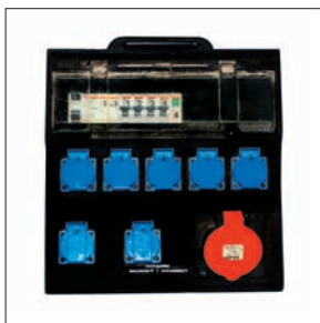
Panou Electric 380V/220V EUR 100.00 Cod 019.010.265.000