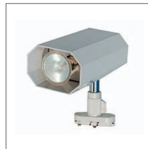
Spot halogen SY STAR 50W(A) EUR 15.00 Cod 019.010.186.000