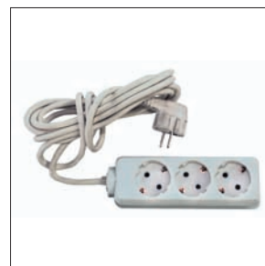
Prelungitor 230V, 10A, 3m EUR 10.00 Cod 019.010.277.000