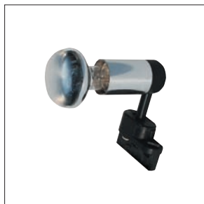
Lampa spot 100W EUR 12.00 Cod 019.010.188.000