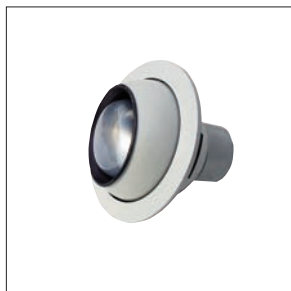
Lampa spot 100W EUR 12.00 Cod 019.010.170.000