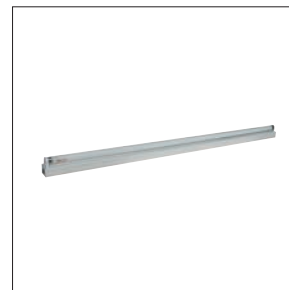
Lampa fluorescenta FIA EUR 15.00 cu instalatie electrica completa 1x40W Cod 019.010.110.000