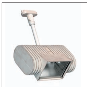
Reflector halogen SYMA STAR 300W EUR 35.00 Cod 019.010.200.006