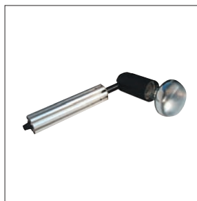
Lampa spot stut OCTANORM EUR 12.00 Cod 019.010.187.000