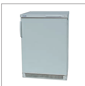
Frigider 125 FB EUR 24.00 Cod 025 010 070 031