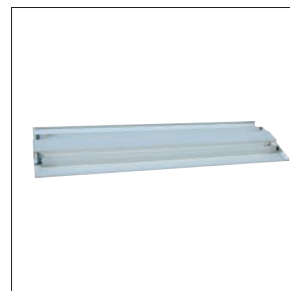
Corp fluorescent tip OCTANORM EUR 20.00 cu doua tuburi D-171 Cod 019.010.200.000