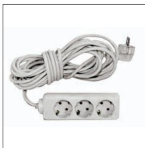
Prelungitor 230V, 10A, 5m EUR 10.00 Cod 019.010.279.000