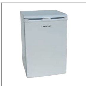
Racitor (140 l) EUR 24.00 Cod 025 010 070 010 (55 x 61 x 84 cm)