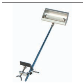
Reflector cu brat 300W EUR 35.00 Cod 019.010.200.010