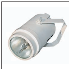
Reflector HQI 80W EUR 35.00 Cod 019.010.200.030