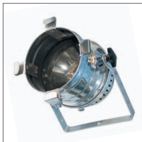
Reflector PAR64 500-1000W EUR 40.00 Cod 019.010.200.020