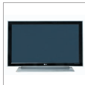
TV Plasma EUR 25.00/zi Cod 025 010 130 040