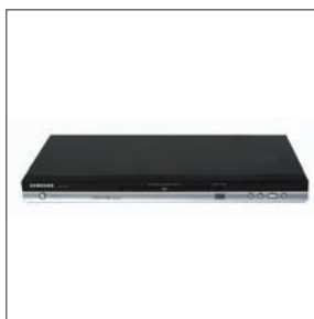
DVD Player EUR 40.00 Cod 025 010 130 030