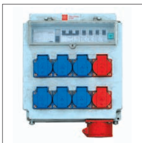
Panou Electric OCTANORM EUR 120.00 Cod 019.010.275.000