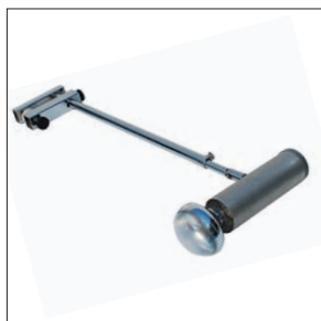
Lampa spot cu brat 100W EUR 12.00 Cod 019.010.181.000