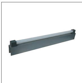
Corp fluorescent tip SS30 EUR 15.00 cu un tub D-170 Cod 019.010.190.000