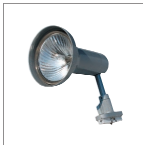
Spot halogen SY STAR 100W EUR 15.00 Cod 019.010.185.000