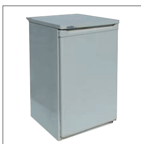
Frigider ARCTIC (180 l) EUR 44.00 Cod 025 010 070 020