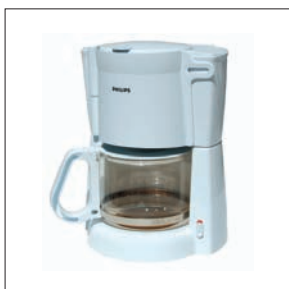
Filtru de cafea EUR 4.00 Cod 025.010.120.010