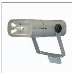
Reflector IVEN HQI 150W EUR 35.00 Cod 019.010.200.005