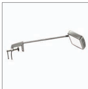
Reflector tija LED A++ EUR 35.00 16W 1100LM 4000K ARM33CM Cod 019.010.200.040