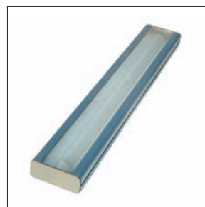
Corp fluorescent tip SYMA STAR Cod 019.010.200.001