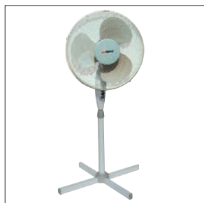
Ventilator cu picior Cod 025.010.500.020