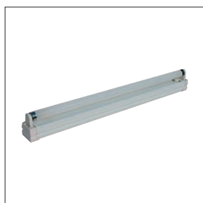
Corp fluorescent tip SS30 cu un tub D-170 - A Cod 019.010.190.001