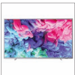
TV LED SMART 4K, UHD ultrasubtire (diagonala ecran: 126 cm) Cod 025 010 130 045