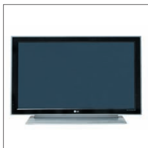
TV Plasma (diagonala ecran: 107 cm) Cod 025 010 130 040