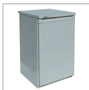
Frigider ARCTIC (180 l) Cod 025 010 070 020