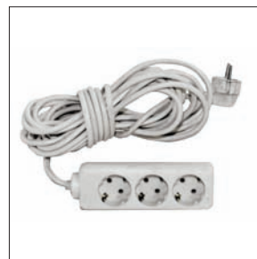
Prelungitor 230V, 10A, 5m Cod 019.010.279.000