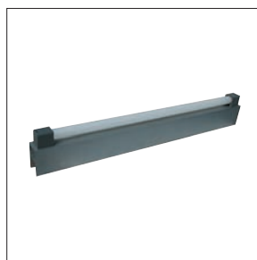
Corp fluorescent tip SS30 cu un tub D-170 Cod 019.010.190.000