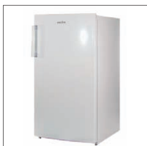
Frigider ARCTIC FB 155 Cod 025 010 020 198