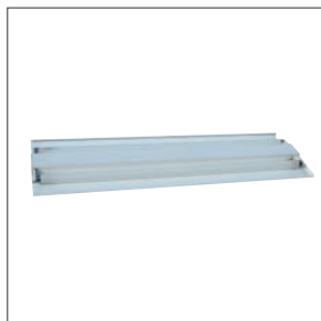
Corp fluorescent tip OCTANORM cu doua tuburi D-171 Cod 019.010.200.000