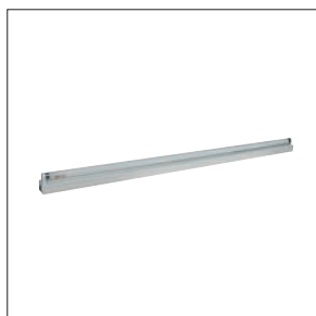
Lampa fluorescenta FIA cu instalatie electrica completa 1x40W Cod 019.010.110.000