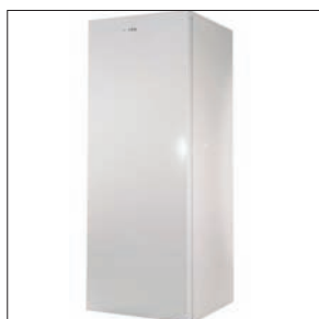
Frigider ARCTIC 255 l Cod 025 010 020 199