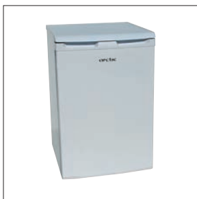
Racitor (140 l) Cod 025 010 070 010 (55 x 61 x 84 cm)