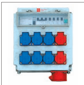
Panou Electric OCTANORM Cod 019.010.275.000