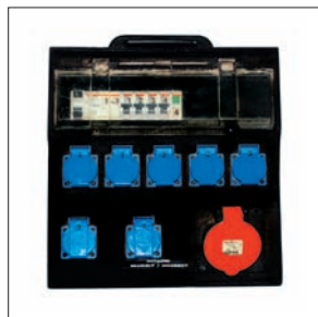
Panou Electric 380V/220V Cod 019.010.265.000